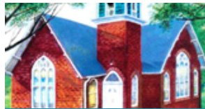
STALLINGS METHODIST CHURCH