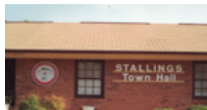
TOWN HALL IN 1979